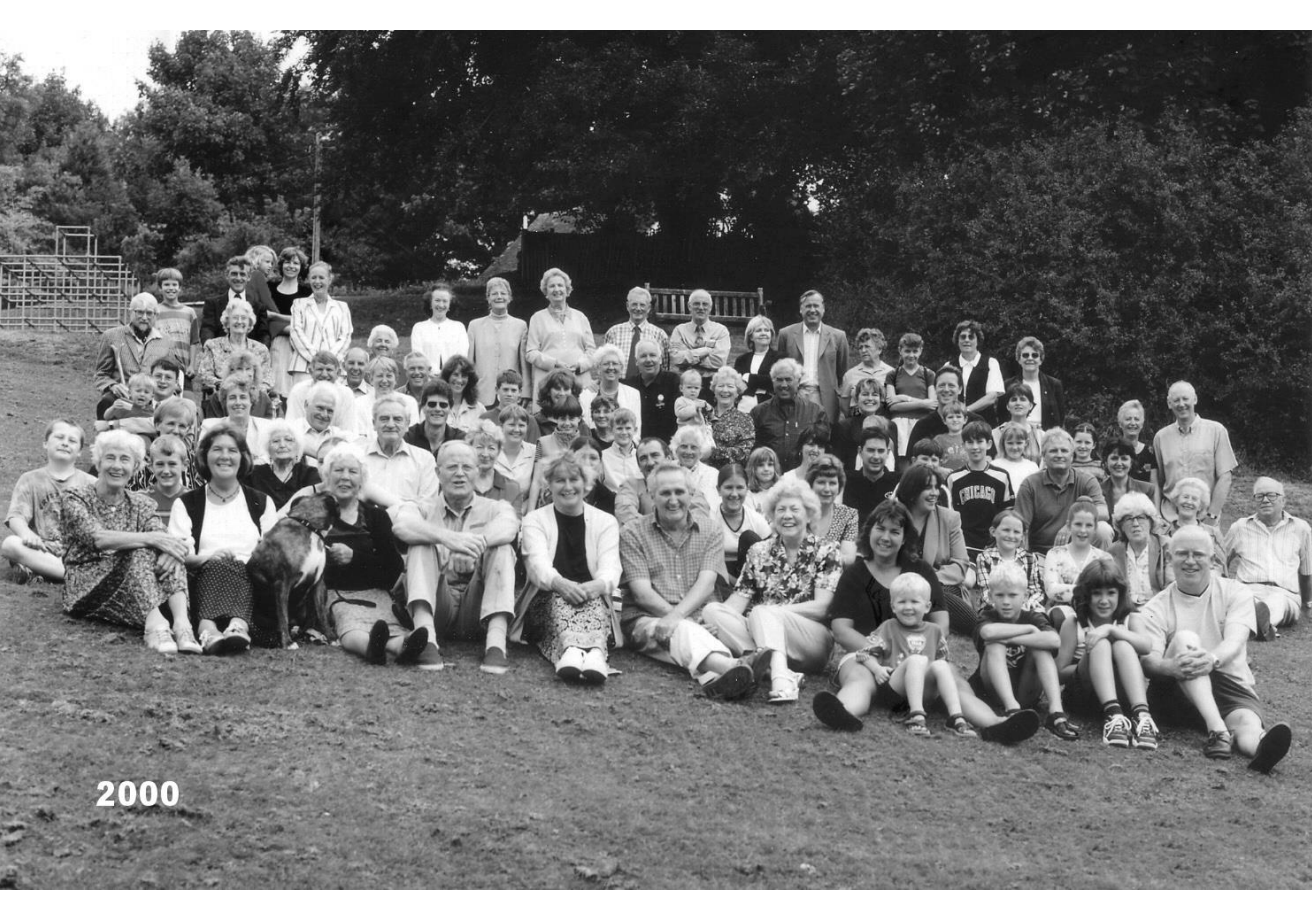
Residents in the village of Alkham in 1937 and at the Millennium